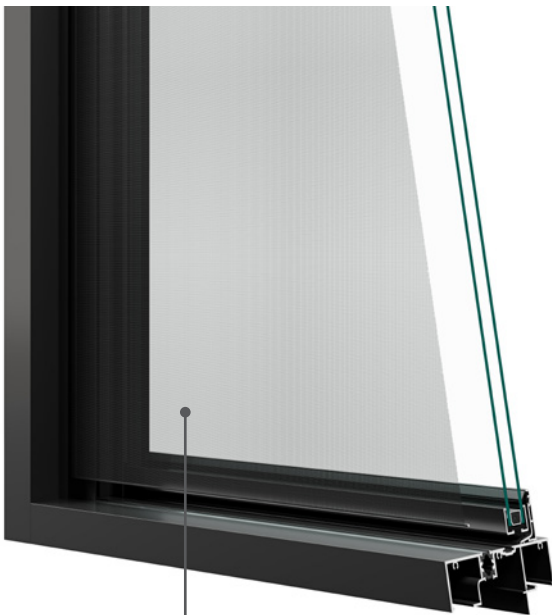
Aluminium screen fixed internally

Screens fixed externally to provide fresh airflow while keeping insects out.