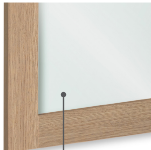
Mirror and Glass